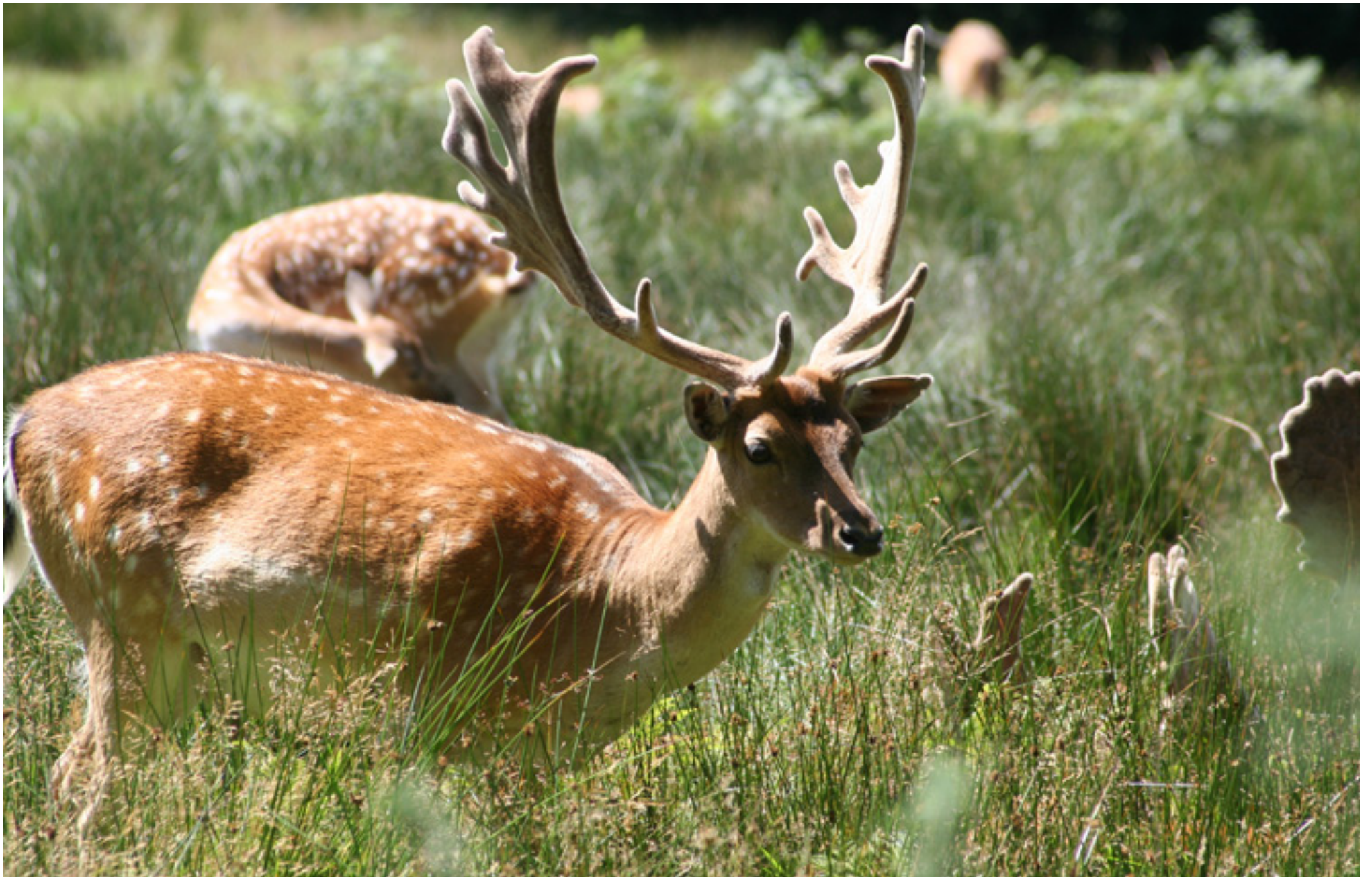
The nearby New Forest is famed for its abundant wildlife. Learn about the animals that inhabit the English countryside and make the local area so special