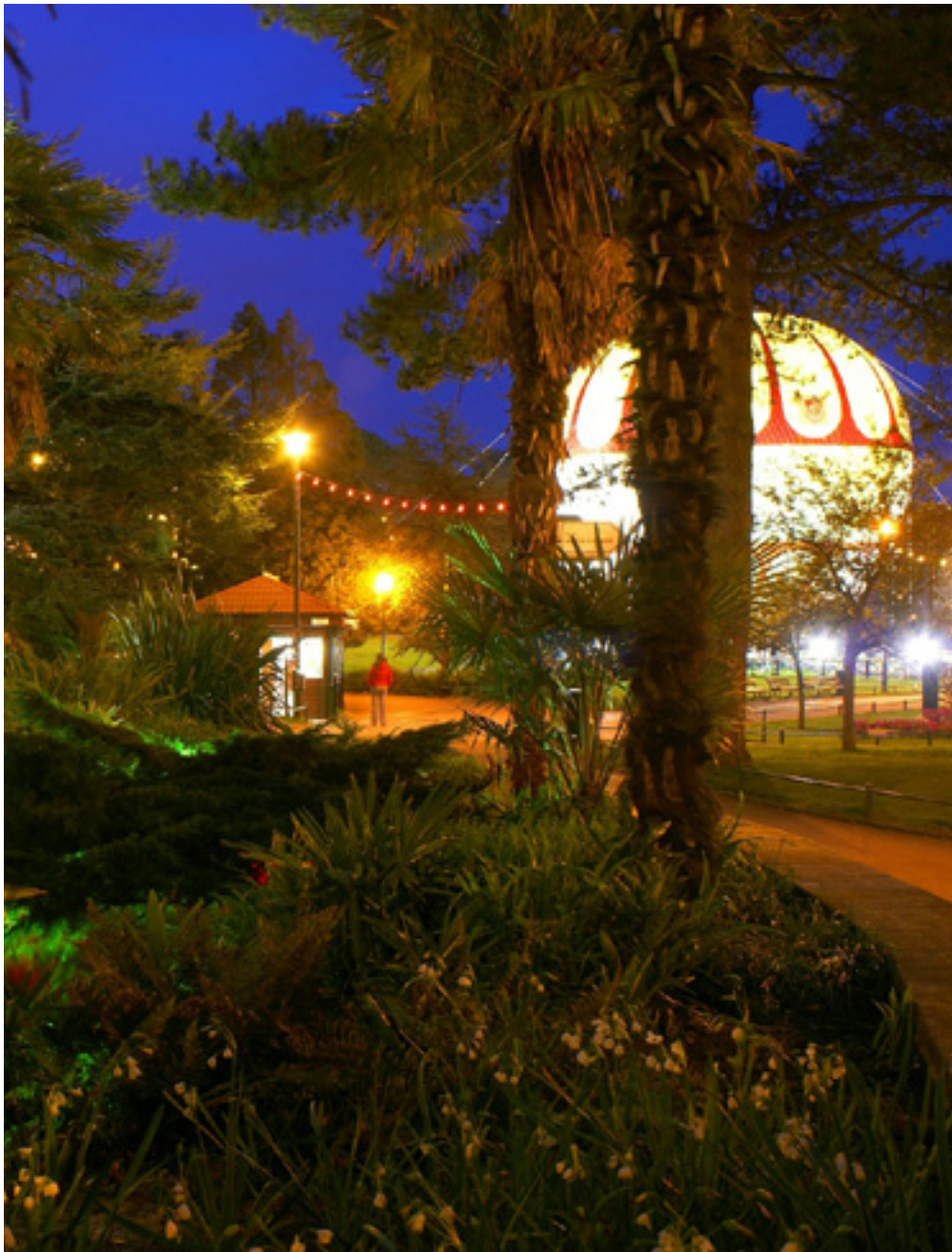
Bournemouth's Lower Gardens at night