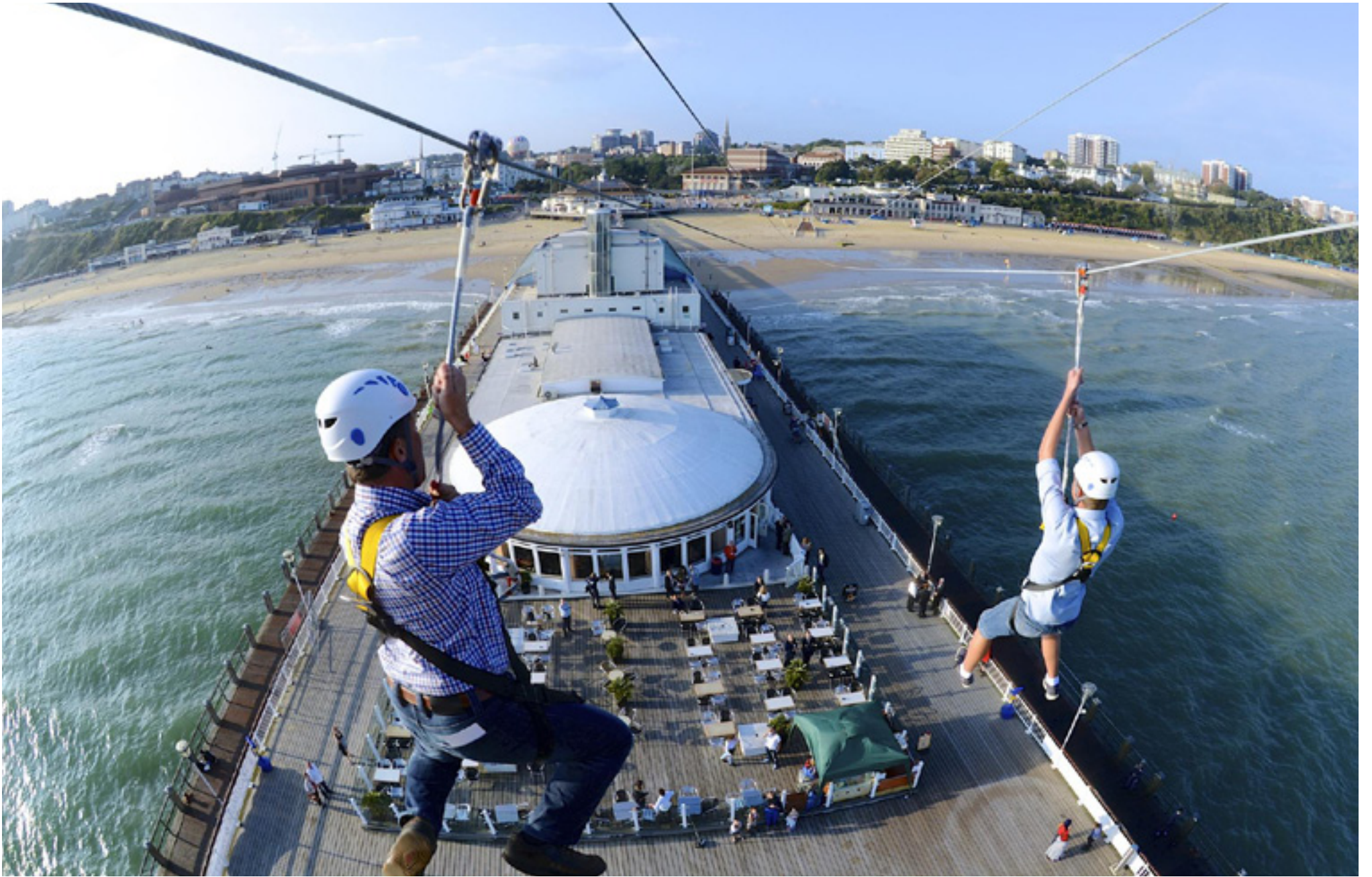
Why not try something unique like the first ever pier-to-beach zip wire?