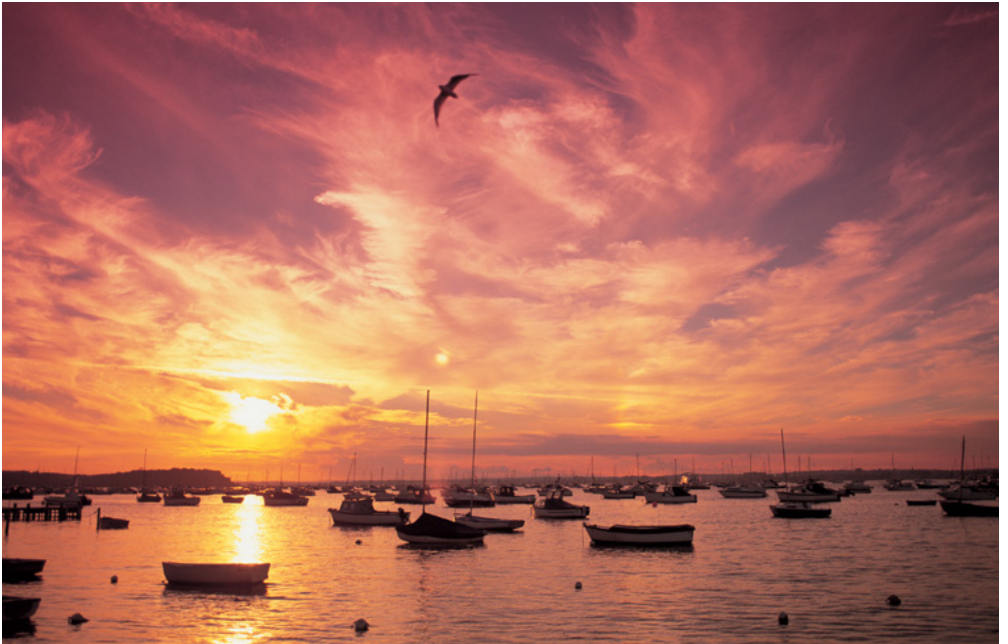
The sun setting over the stunning Poole Harbour