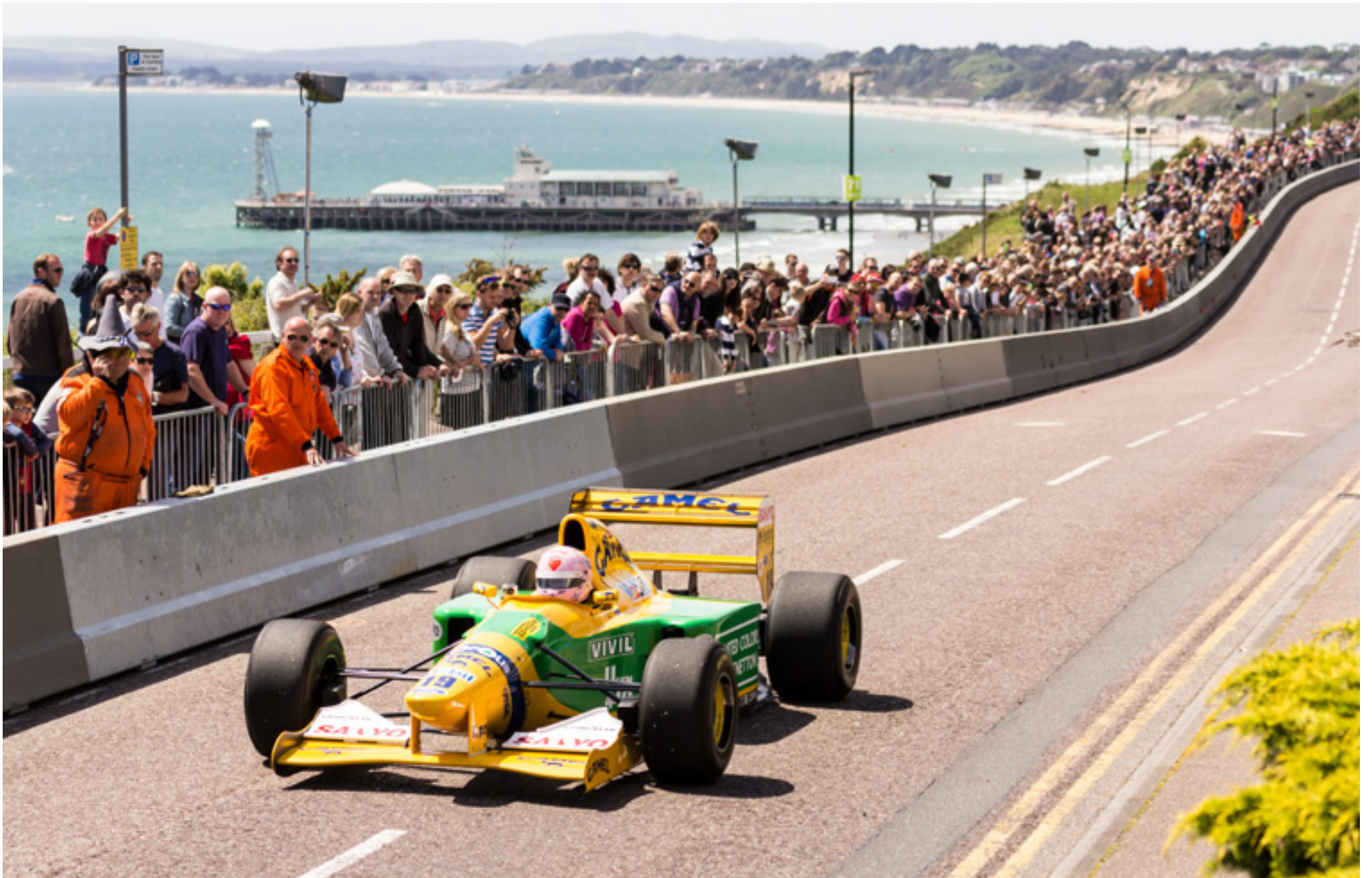
Taking place between Bournemouth's two historic piers and spanning a 1.5 mile stretch of stunning coastline, Bournemouth Wheels Festival offered three packed days of pageants and displays