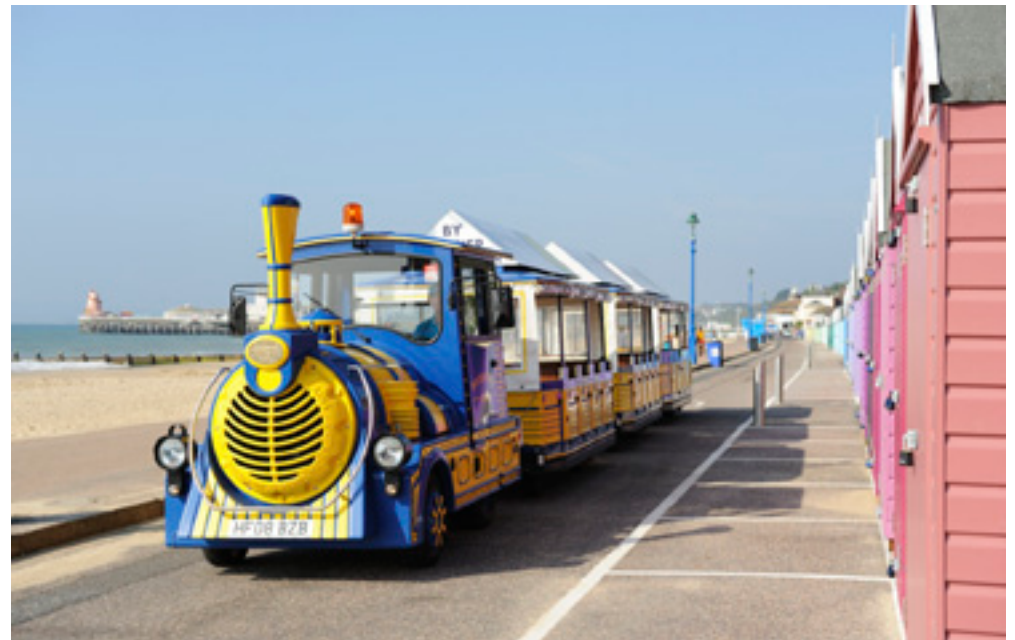
Bournemouth beach stretches across seven miles of golden sands. Stroll, cycle or hop aboard the land train to see the best of it!