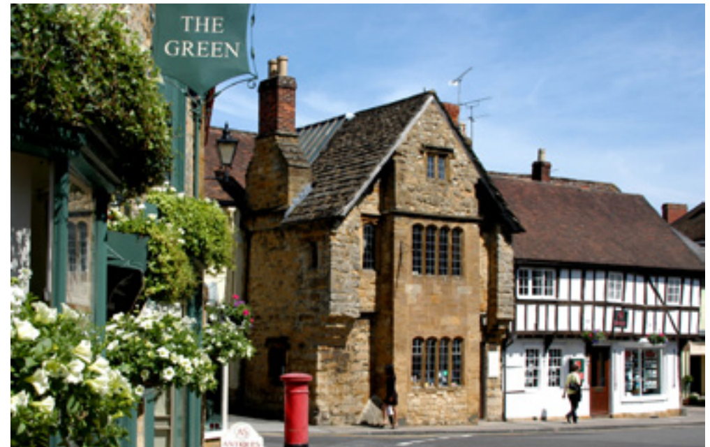
The Bournemouth vicinity has a great selection of historical sites for you to explore. Clockwise from top left: the birthplace of novelist and poet, Thomas Hardy, the ruins of Corfe Castle accessible via steam railway, traditional Tudor architecture in the nearby town of Sherborne and the Grade I listed Highcliffe Castle