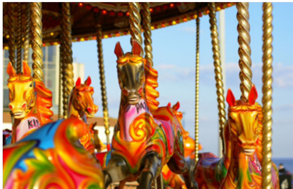
Bournemouth offers all the traditional seaside fun you'd expect to find as well as so much more