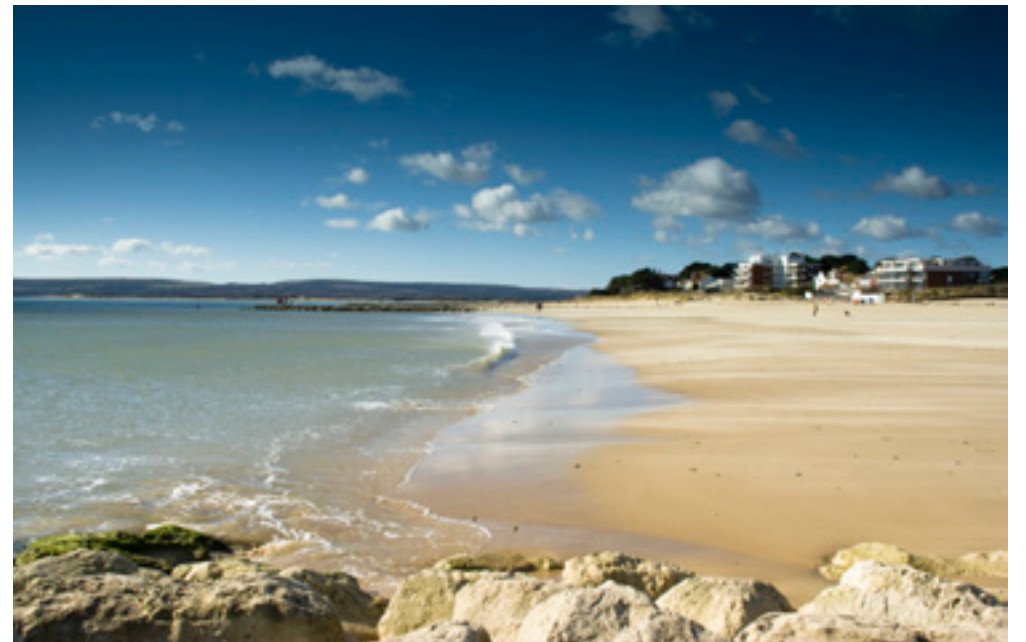
Swim, sail or simply enjoy the fresh seafood at Poole Quay and Sandbanks Beach