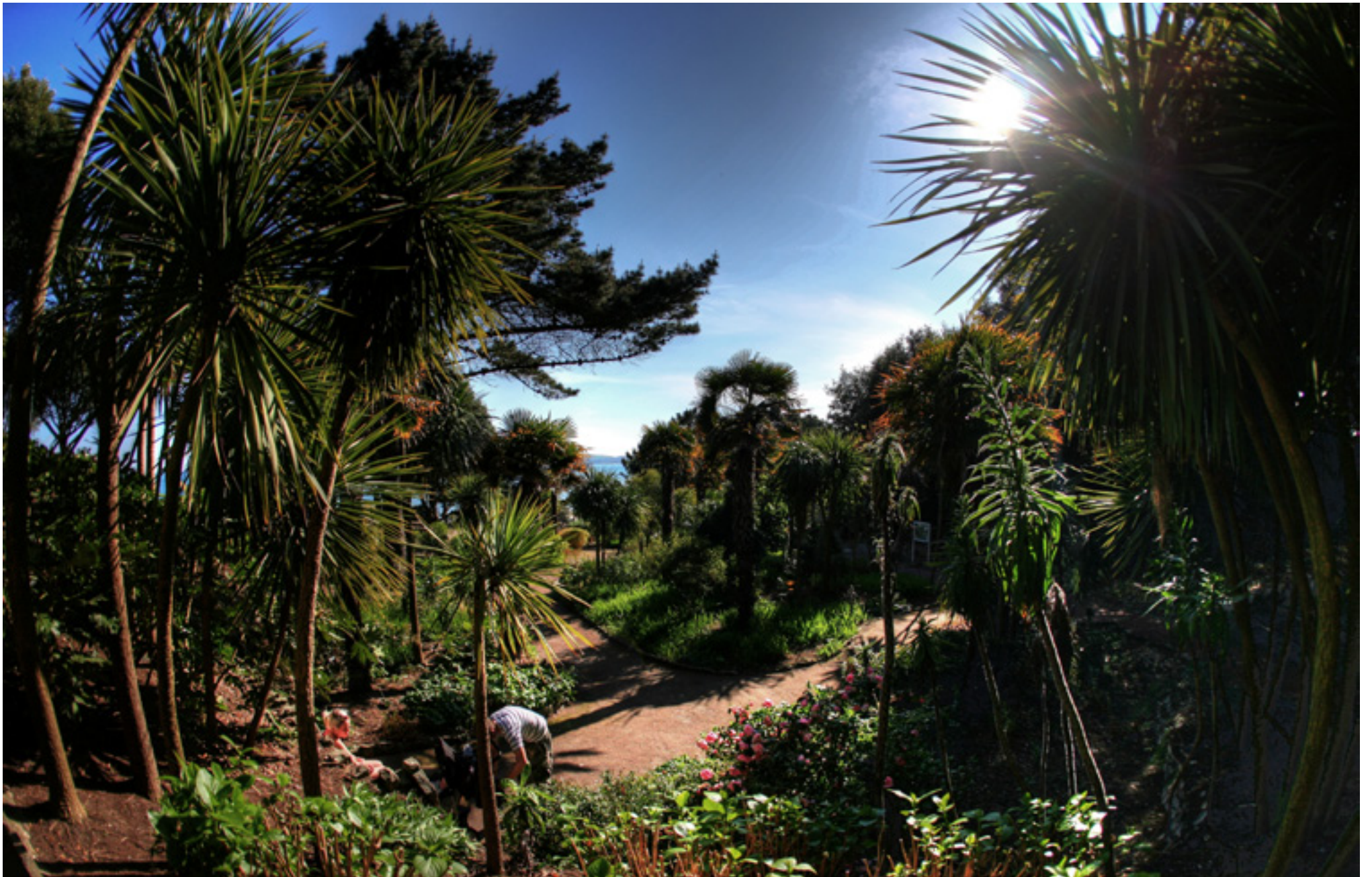
The glorious Alum Chine Gardens: with the Blue Flag beach below, the gardens have become renowned for their award-winning facilities, striking design and stunning views