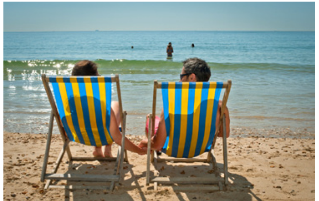
The beach huts in Bournemouth and Poole are available to rent all year round