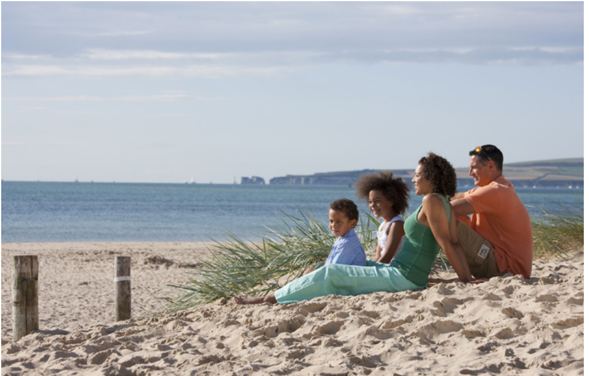
The Isle of Purbeck is located west of Bournemouth, with natural beauty spots such as Old Harry Rocks (pictured)