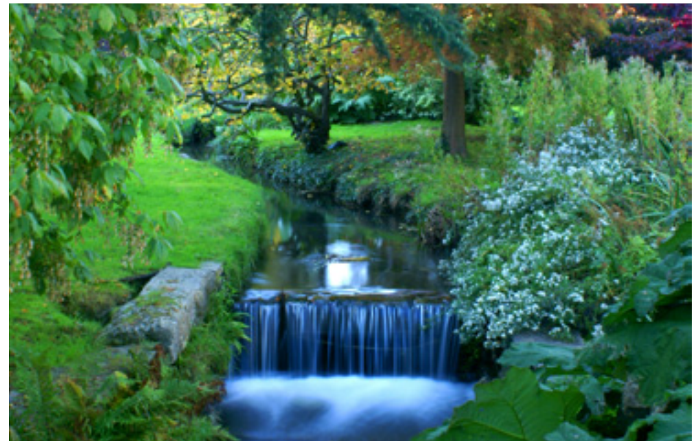
The Lower Gardens are renowned for their floral bedding displays throughout the year, which are designed to bring together brilliant colours, subtle textures, height variations and scent