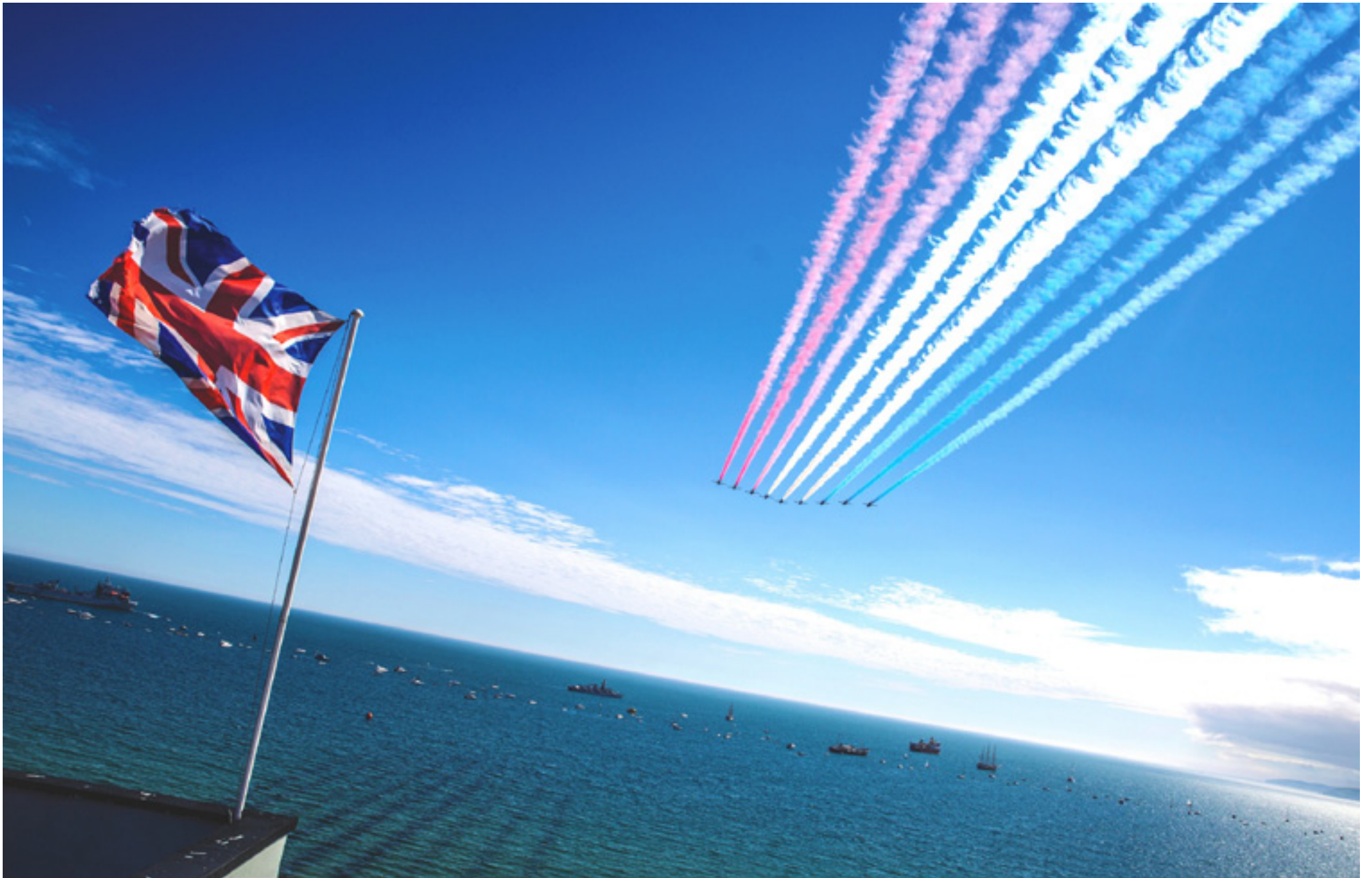
Every August, the award winning Bournemouth Air Festival offers one of the largest air displays in the country