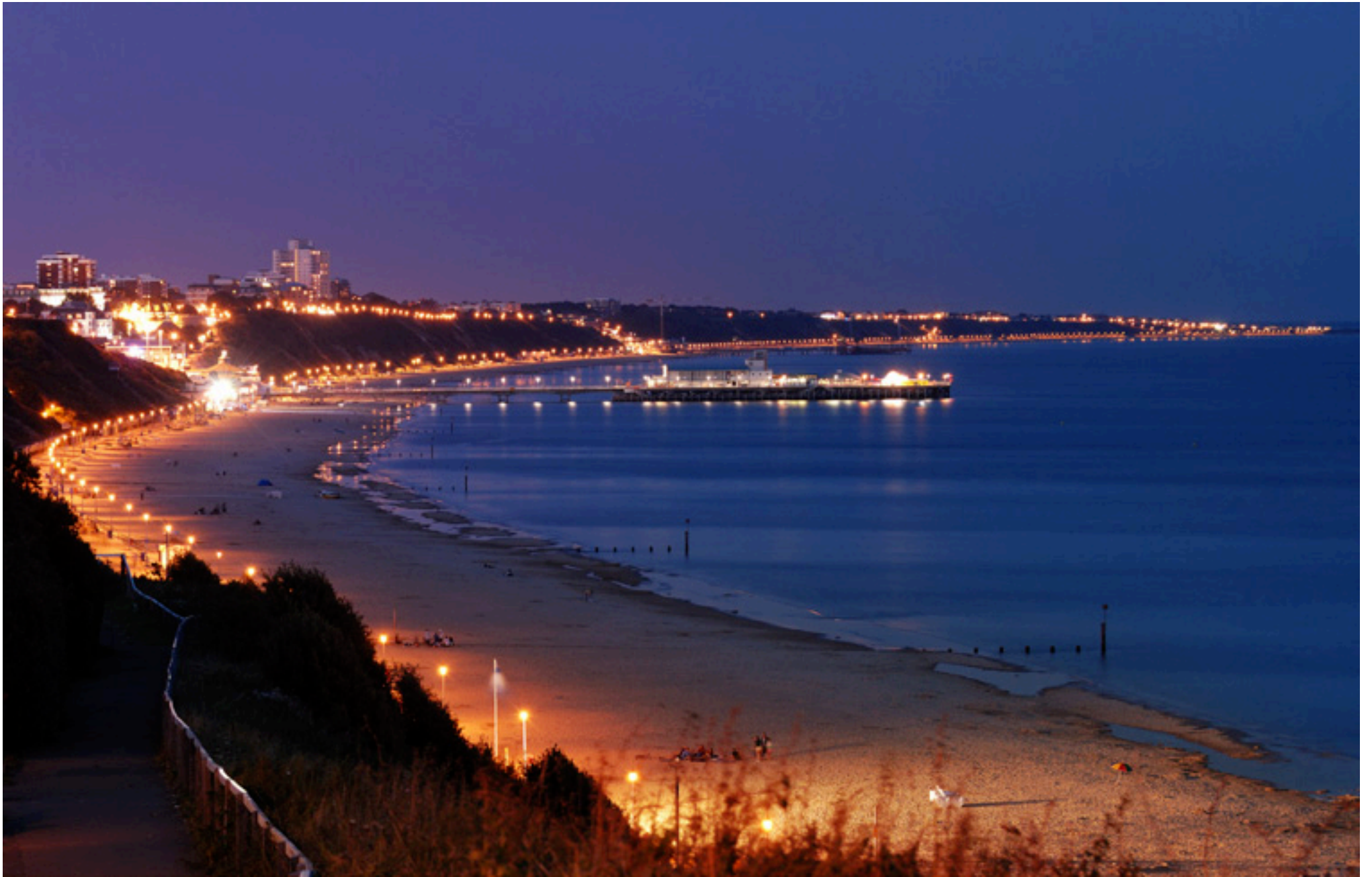
Bournemouth beach at night