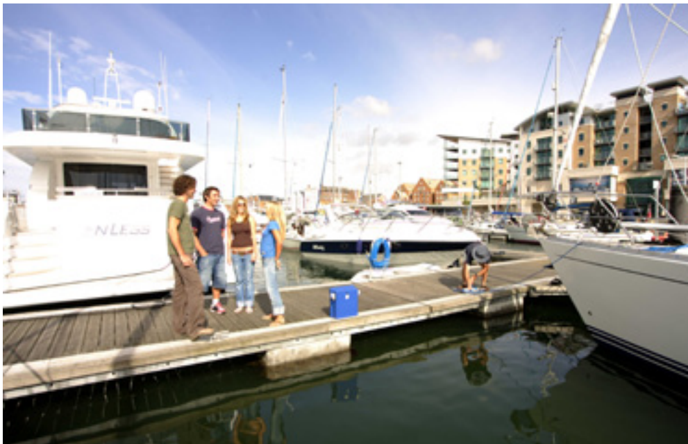
The pretty harbour town of Poole