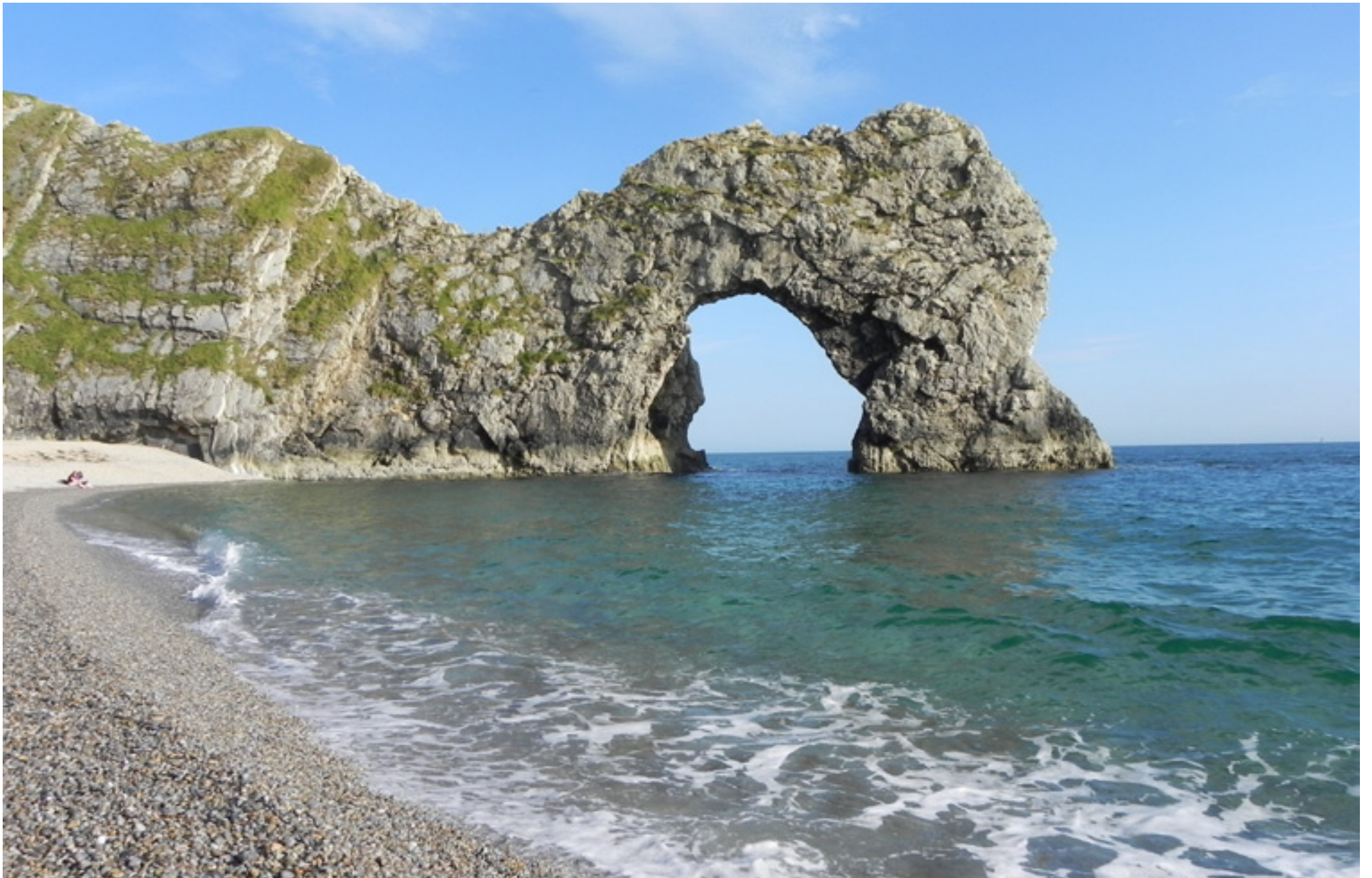
On Dorset's Jurassic Coast lies the 140 million year old limestone formation of Durdle Door. A popular visitor spot, the heritage site lies 20 miles west of Bournemouth and makes for the perfect day trip