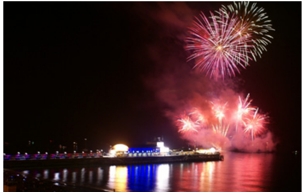
Day and night Bournemouth Air Festival delights locals and visitors with four days of jaw-dropping stunts, incredible jets and display teams