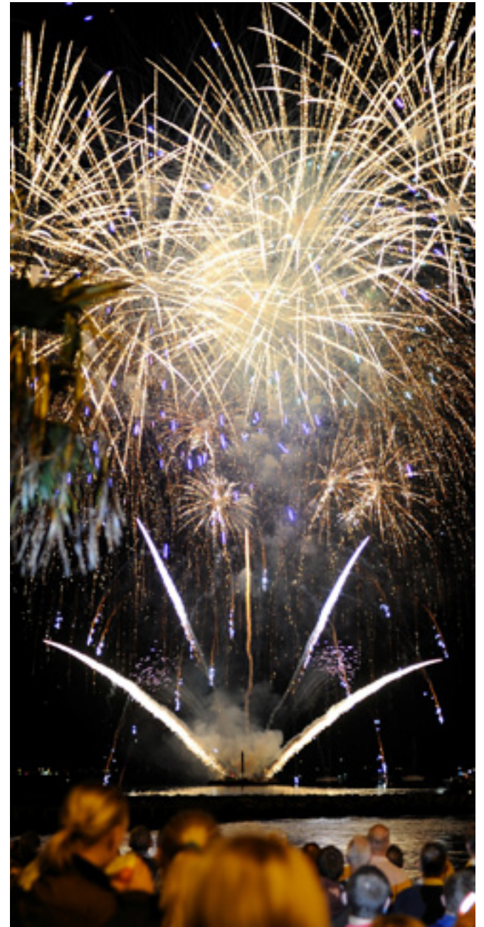
Summer brings a whole spectacle of events to Poole Quay. Enjoy stunning weekly firework displays, live entertainment and the breathtaking views across the harbour