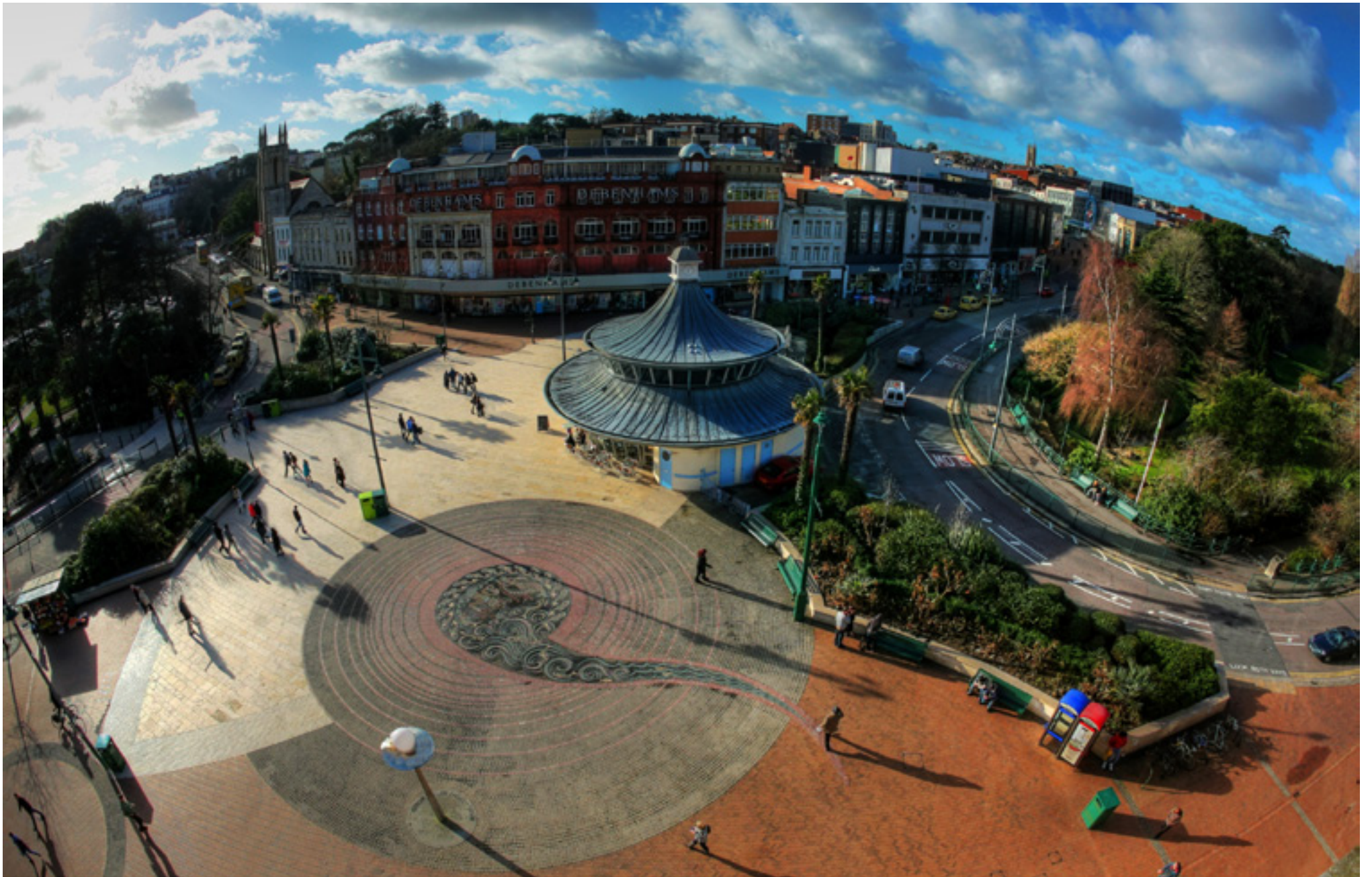
Bournemouth Square, located minutes away from the beach and Lower Gardens