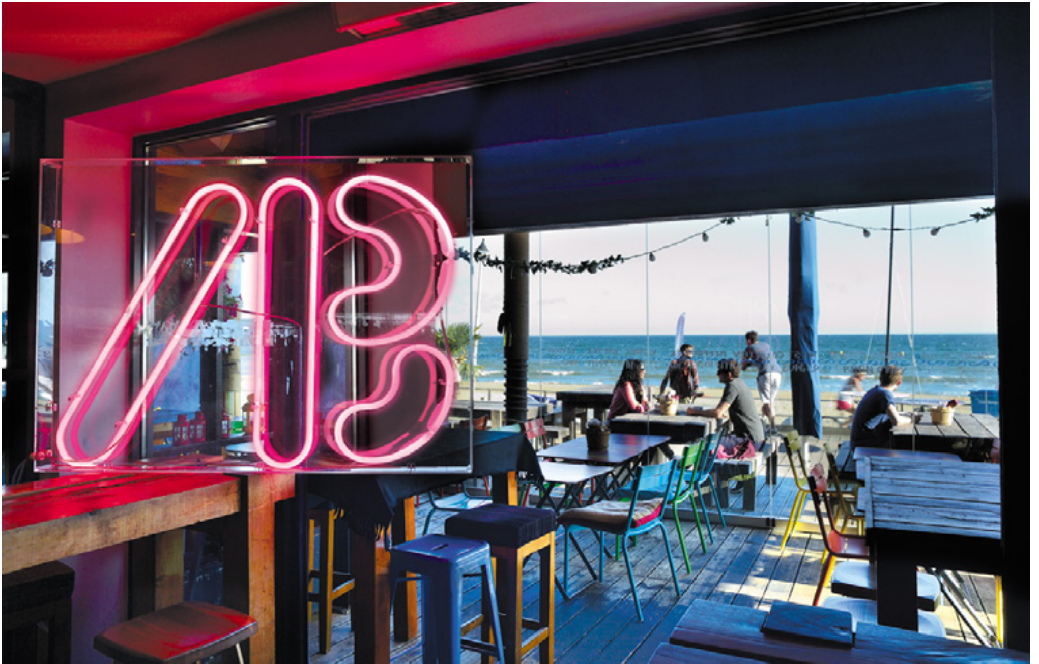
Arts Bournemouth exists to support and develop the arts in Bournemouth and delivers the annual Bournemouth Arts by the Sea Festival