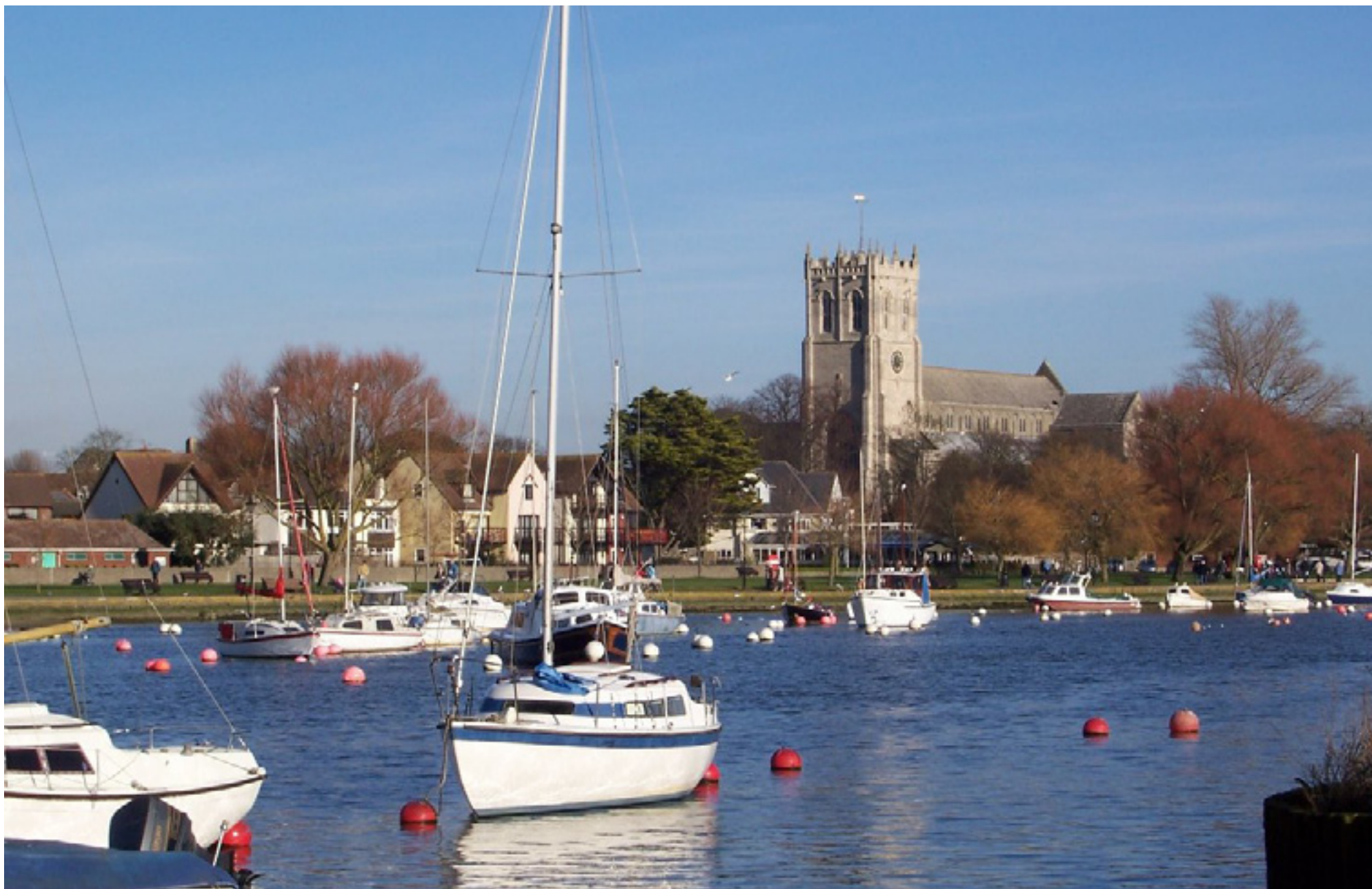
The neighbouring quayside town of Christchurch