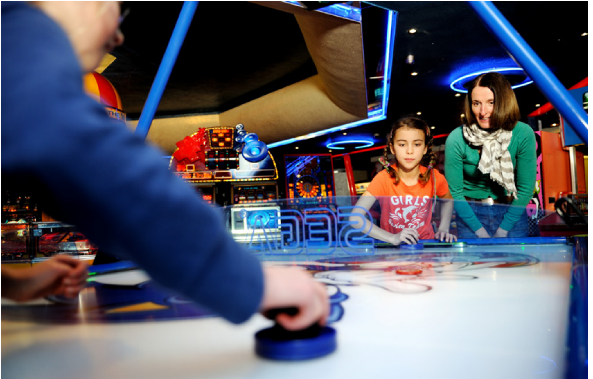
Test your competitive side end enjoy traditional seaside entertainment, such as the Pier Amusements