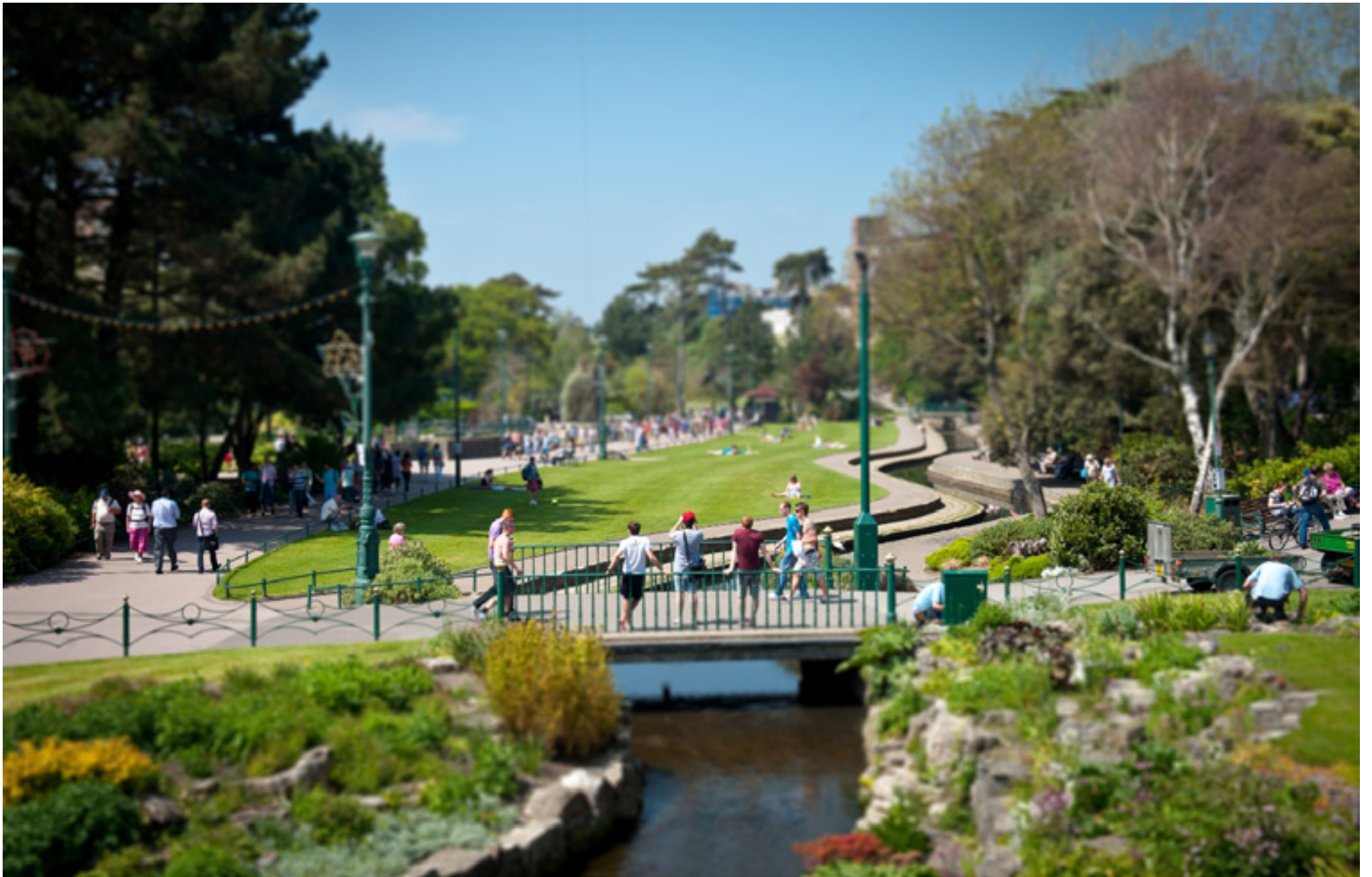
The Lower Gardens in Bournemouth are only a five minute walk from the main shopping centre, the beach and the pier. They are also home to the famous Bournemouth Balloon