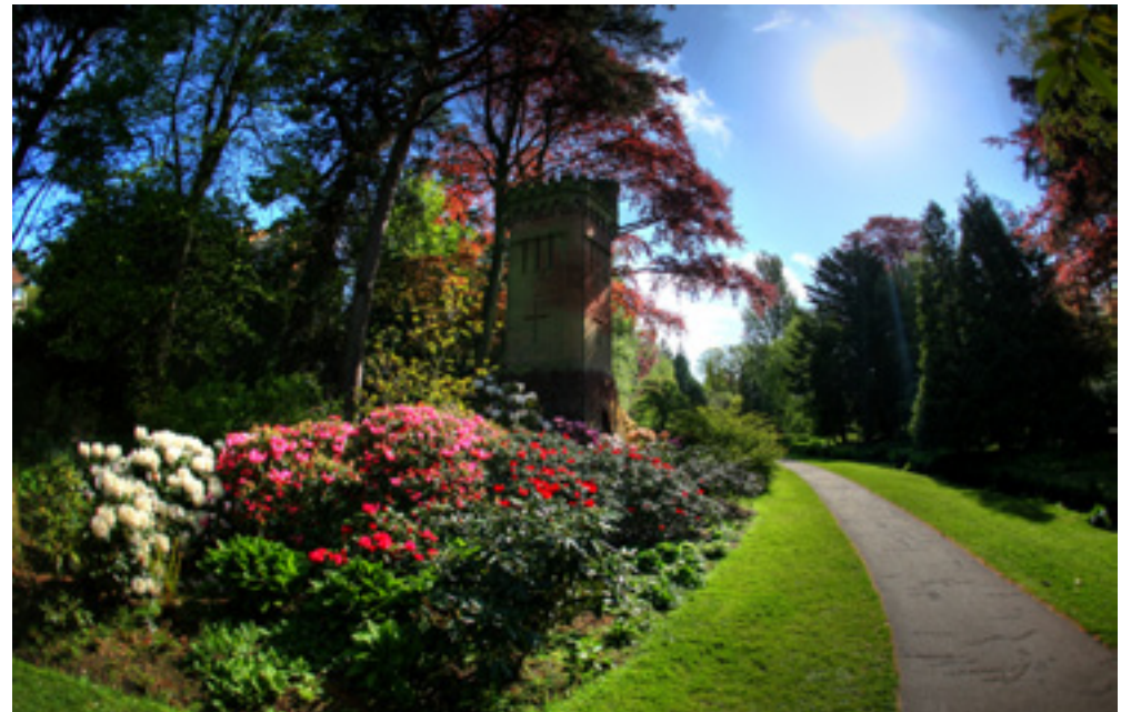
Bournemouth offers 2,000 acres of glorious gardens and parks just waiting to be explored all year round