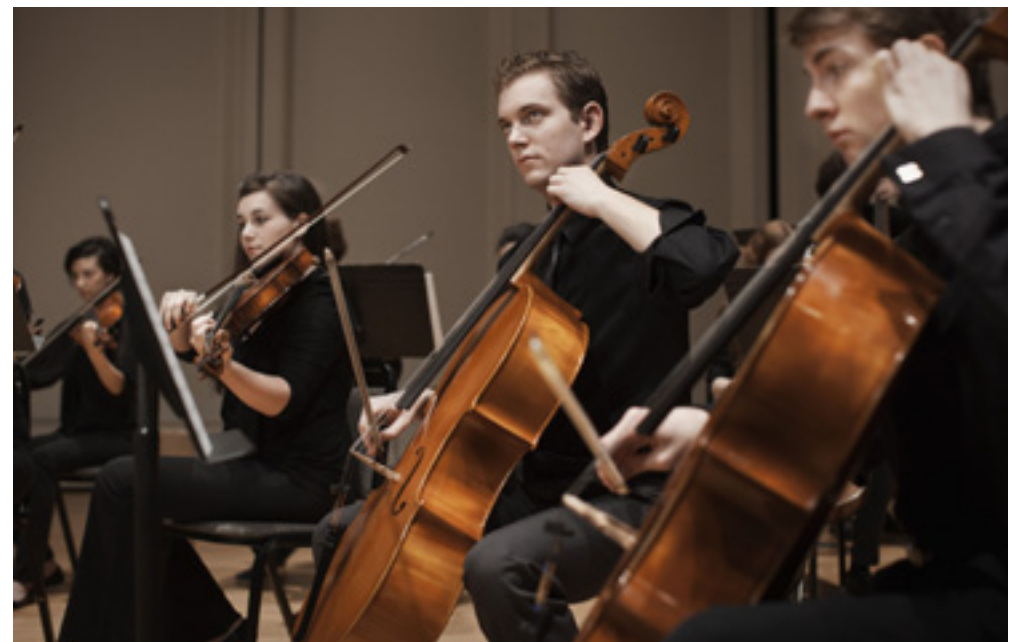
Immerse yourself in the arts! Bournemouth offers a range of arts-focused events such as Bournemouth Arts by the Sea Festival (pictured, top left, top right and bottom left) and is home to the world-renowned Bournemouth Symphony Orchestra (bottom right)