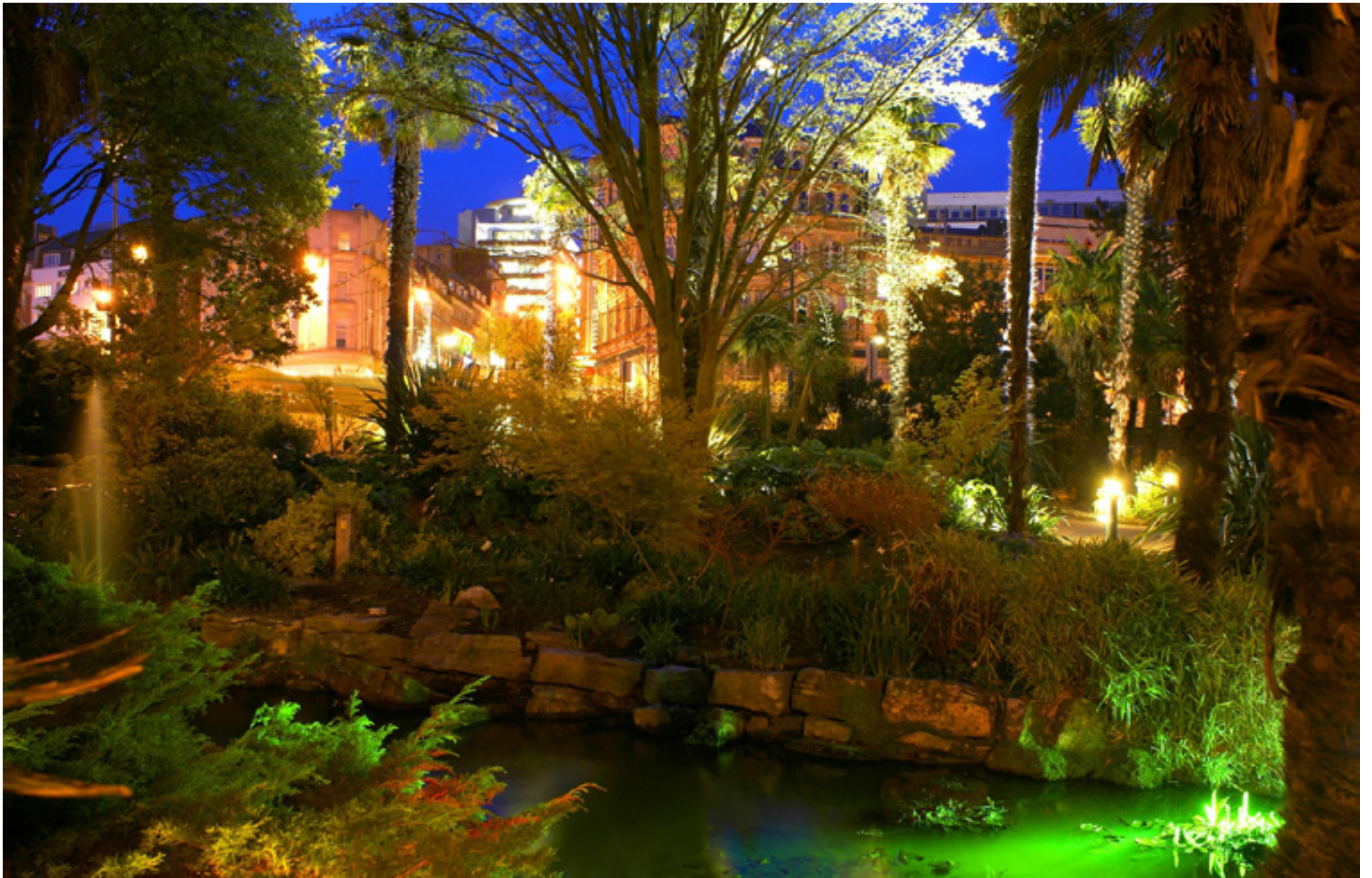
The River Bourne in Bournemouth's Lower Gardens, located seconds from the town centre